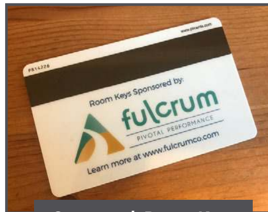
Sponsored Room Keys at the 2018 Global SOF Symposium - US.