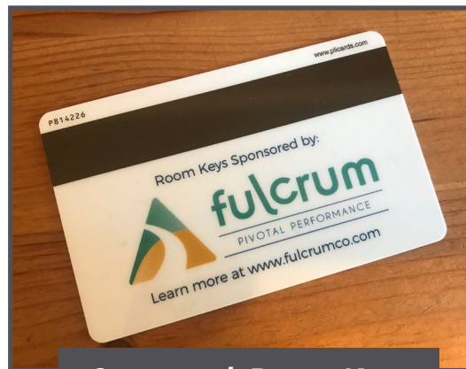
Sponsored Room Keys at the 2018 Global SOF Symposium - US.